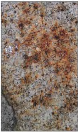
Surface Rust on Granite

Technical Bulletin 2 addresses stubborn stains and some tips on how to use our product in the most effective way. I recently was asked to consult on a very difficult job, requiring me to repeat the process 6 times. This bulletin includes my recommendations for these types of difficult jobs.